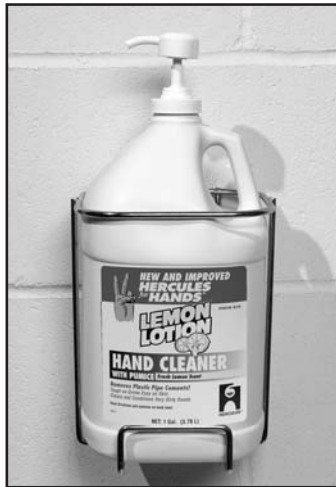
1 Gallon Size Shown in Optional Wall Bracket