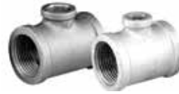
MATCO-NORCA MODEL NUMBER BLACK GALVANIZED