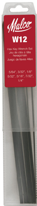
W12 7 Piece Set Big 12 in. Length