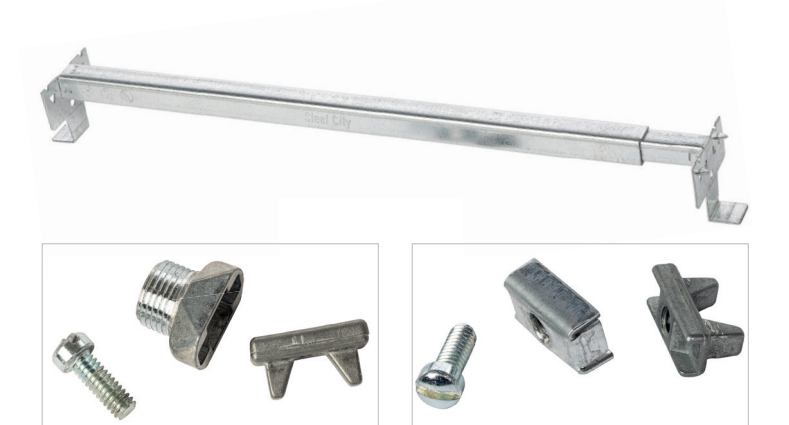
01 Series with stud