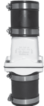
30-0021 Pvc Plastic

Consult Factory or local representative for state approvals