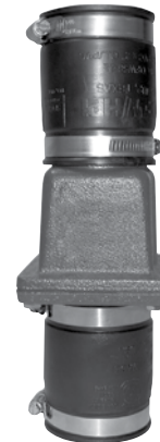
30-0151 Cast Iron