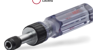
CONNEXT 3 Ratcheting Handle