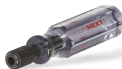
CONNEXT 1 Standard Handle