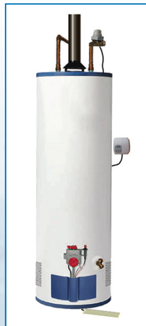
FS1/2NPT- Water Heaters FS3/4NPT- Water Heaters FS3/4C - Water Heaters FS1NPT - Water Heaters FS125NPT -Water Heaters