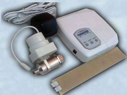
FS3/8C - Dish Washers and Toilets FS3/8CD - Dual Valve for Sink FS1/4C - Ice Makers and Water Filters

OnSite PRO Inc. FLOODSTOP™ Stop Flood Damage Before It Really Starts!