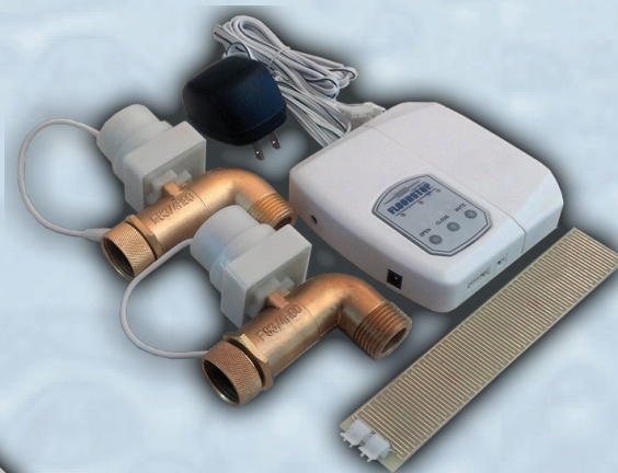
Washing Machines FS3/4H90 Curved Valves FS3/4H - Straight Valves