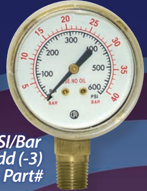
PSI/Bar Add (-3) to Part#