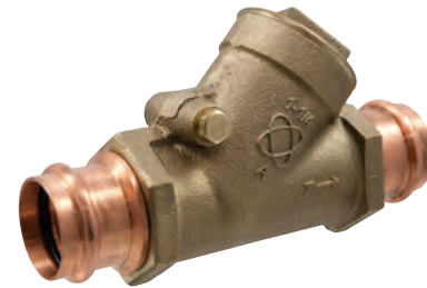
PC-413-Y-LF Press Ends