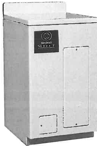
Table Top Electric Water Heaters features convenient flat surface at 36" height, providing extra "counter space" wherever installed.

All plumbing and electrical connections are made through back of water heater. 27 and 40-gallon tank capacities. Equipped with PEXAN™ cross linked PEX polymer dip tube.